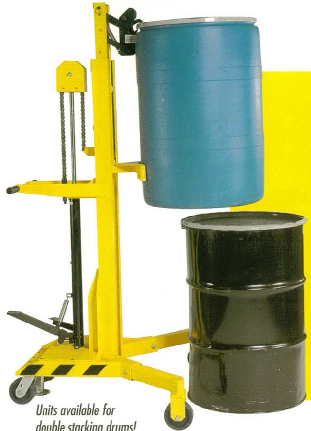
Units available for double stacking drums!