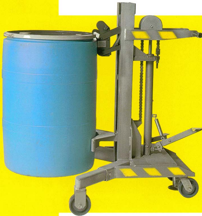
All models available with optional Steel-It™ coating

Perfect for placing drums on/off wooden pallets... and spill containment pallets