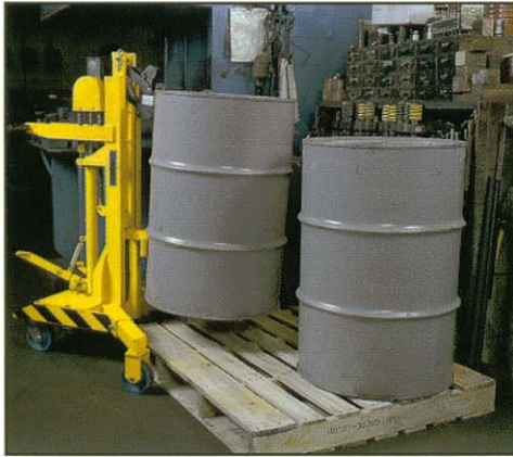
Compact profile for tight work spaces