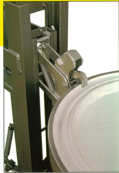
Exclusive "Parrot-Beak®" clamp assembly